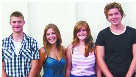
2011 Student Leaders